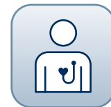
BIOTRONIK Patient App

2 Download the BIOTRONIK Patient App Using your smartphone (Android™ 8.1 or later, iOS 12 or later), go to the App Store® or Google Play™ store. The app is free. (Note: The app will not work on tablets.)